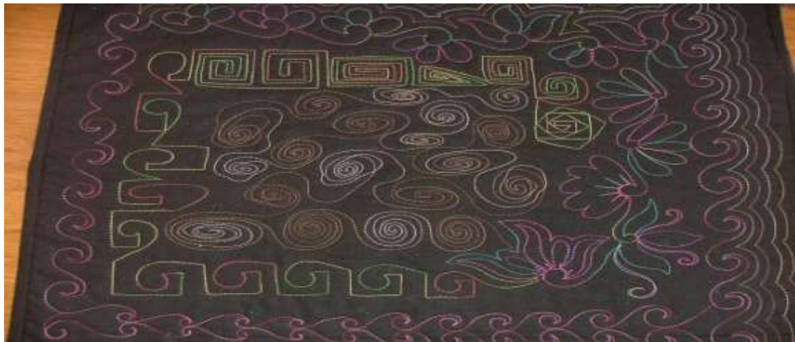
Many valuable ideas for your quilts

Students to bring tops of their own for discussion of how to quilt